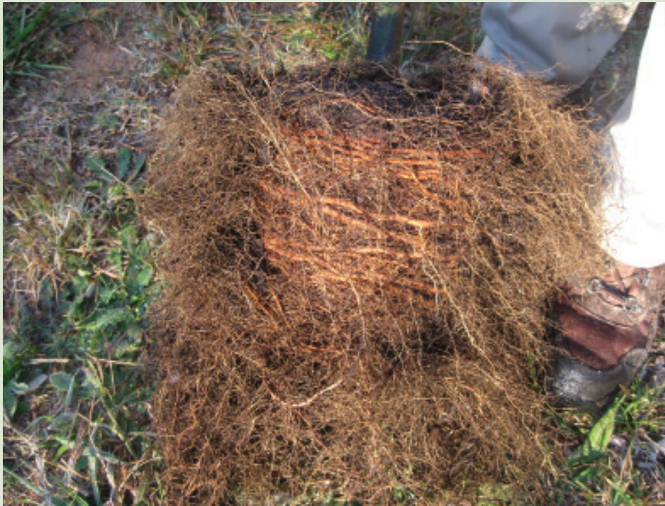
The root ball of this landscape tree shows the multiple layers of circling roots that formed in the container, a condition that will not change when the tree is planted. Disturbing the root ball in a way that severs the layers of circling roots minimizes the problem and enhances the tree's long-term health in the landscape.

it might not otherwise be. An integrated pest management program, which aims to prevent infestations before they take hold, will help.